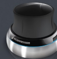
SpaceNavigator™ for Notebooks Portable 3D Mouse