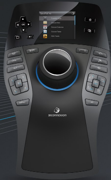
SpacePilot™ PRO The Ultimate Professional 3D Mouse