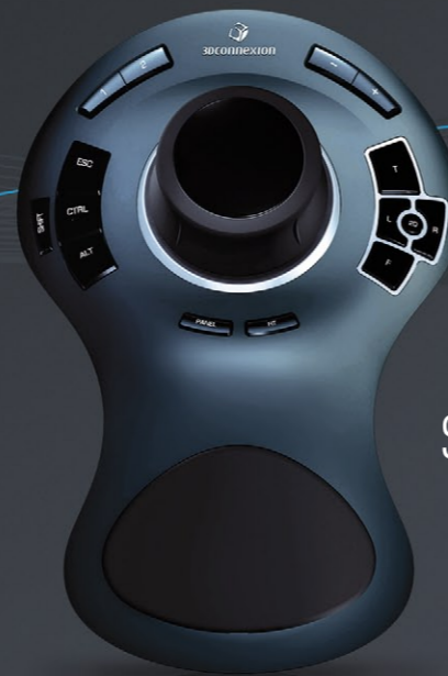
SpaceExplorer™ Professional 3D Mouse