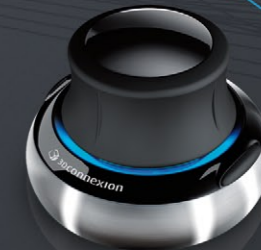
SpaceNavigator™ 3D Mouse

SpacePilot PRO is the ultimate professional 3D mouse, engineered to excel in today's most demanding 3D software environments.