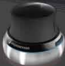
SpaceNavigator™ for Notebooks Enjoy 3D Navigation on the Go