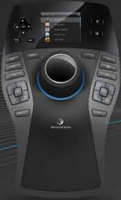
SpacePilot™ Pro Ultimate 3D Navigation for Power Users