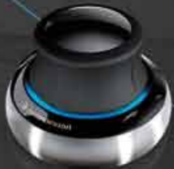
SpaceNavigator™ Advanced 3D Navigation for Everyone

SpacePilot Pro is the ultimate professional 3D mouse, engineered to excel in today's most demanding 3D software environments.