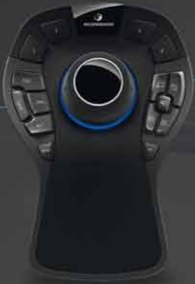
SpaceMouse™ Pro Superior 3D Navigation for Professionals