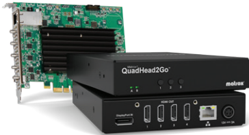
Matrox QuadHead2Go multi-monitor controllers

Matrox QuadHead2Go multi-monitor controllers drive a 12-monitor creative video wall that enlivens EIZO's reception area