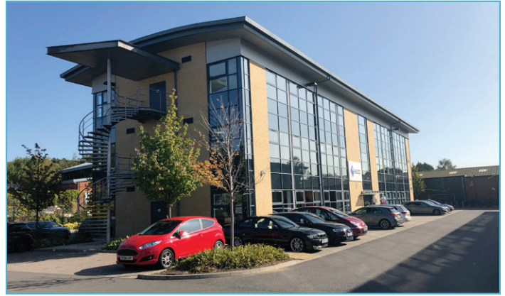
EIZO's new UK office houses a contemporary display wall enabled by Matrox video-wall technology.