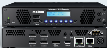
Matrox Maevox 6120 dual 4K encoder appliance (front & back view)

The Maevox 6100 Series is available as system-independent, standalone encoder appliances (Maevox 6150 quad and 6120 dual), as well as a single-slot, high-density PCIe x8 quad encoder card (Maevox 6100).