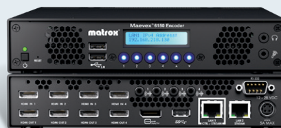
Matrox Maevox 6150 quad 4K encoder appliance (front & back view)