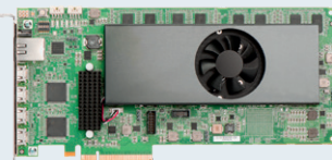
Matrox Maevox 6100 quad 4K PCIe encoder card